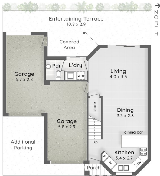
:: FLOOR PLAN 2.7m Ceiling