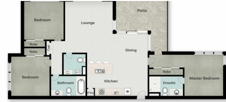
269/25 Parnell Boulevard, Robina