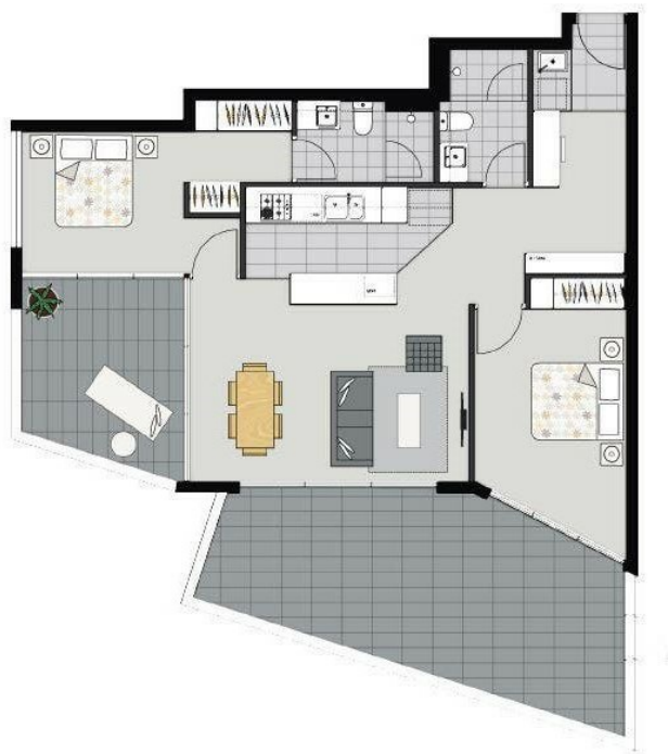
North Tower | Level 2 (Courtyard Units)

spice apartments north tower | south brisbane