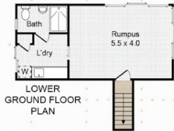
LOWER GROUND FLOOR PLAN