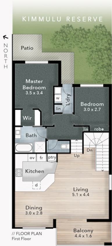
// FLOOR PLAN First Floor