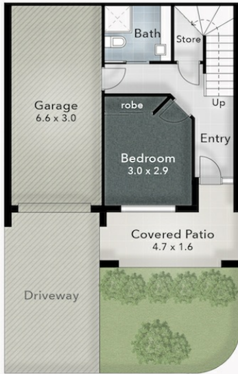
// FLOOR PLAN Ground Floor