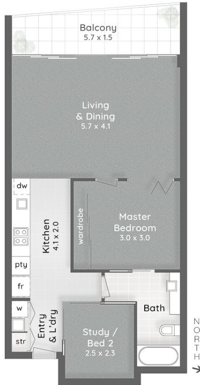
:: FLOOR PLAN Level 6 - 2.7m Ceiling