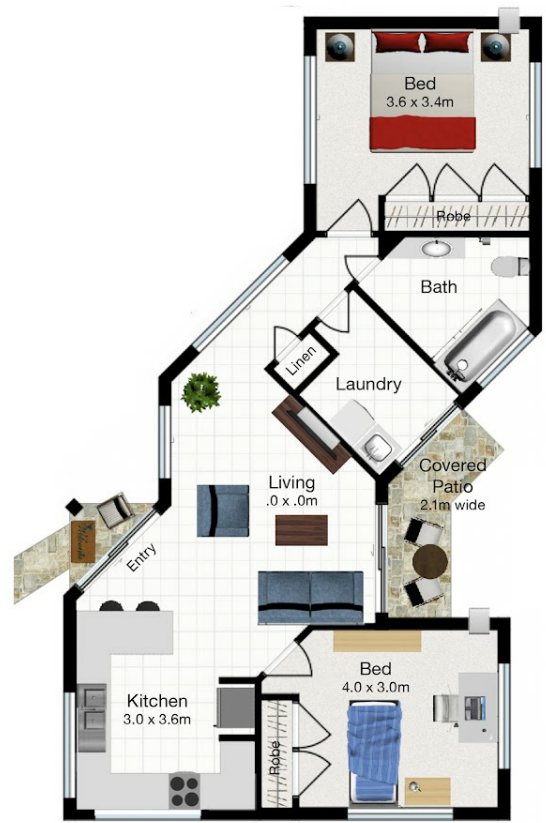
Units 4 Floorplan

(Unit 1 is a mirror-reverse of this plan)