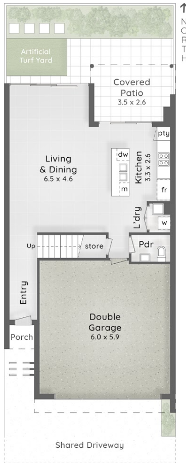
:: FLOOR PLAN & SITE PLAN Ground Floor 2.7m Ceiling