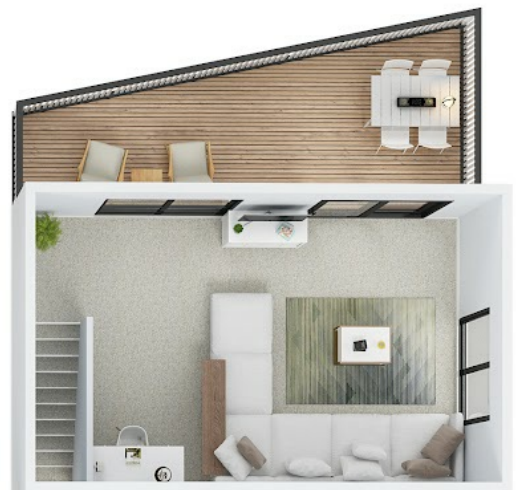
[ ] First floor

Disclaimer: Please note this floor plan is for marketing purposes and is to be used as a guide only. All dimensions are estimates only and may not be exact measurements.