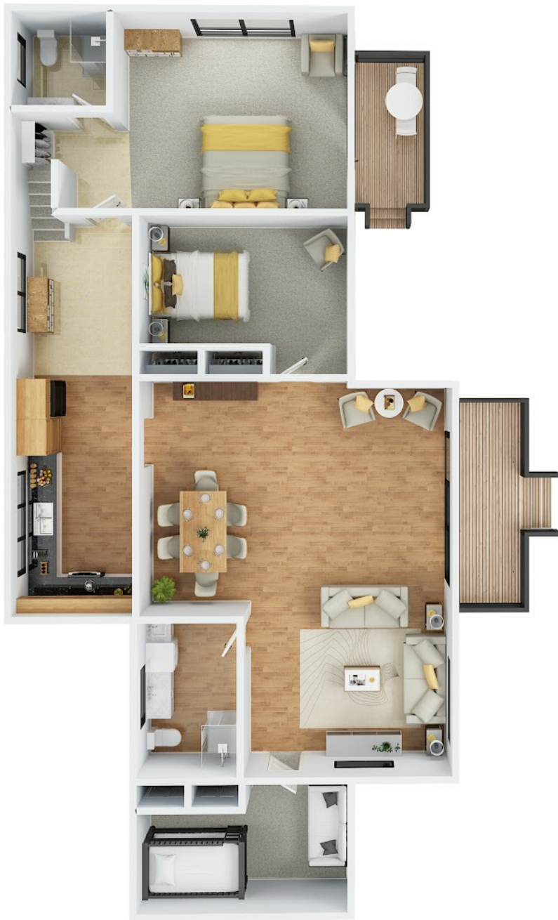
[ ] Ground floor