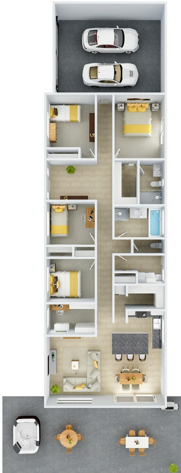
[ ]Ground floor