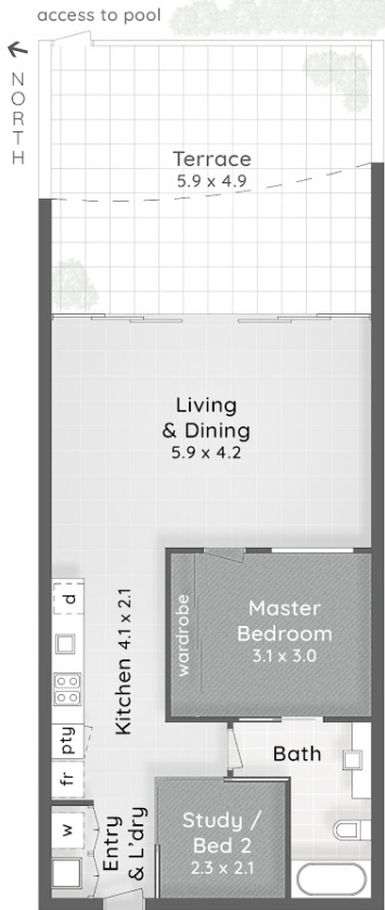
:: FLOOR PLAN Ground Level - 3.0m Ceiling