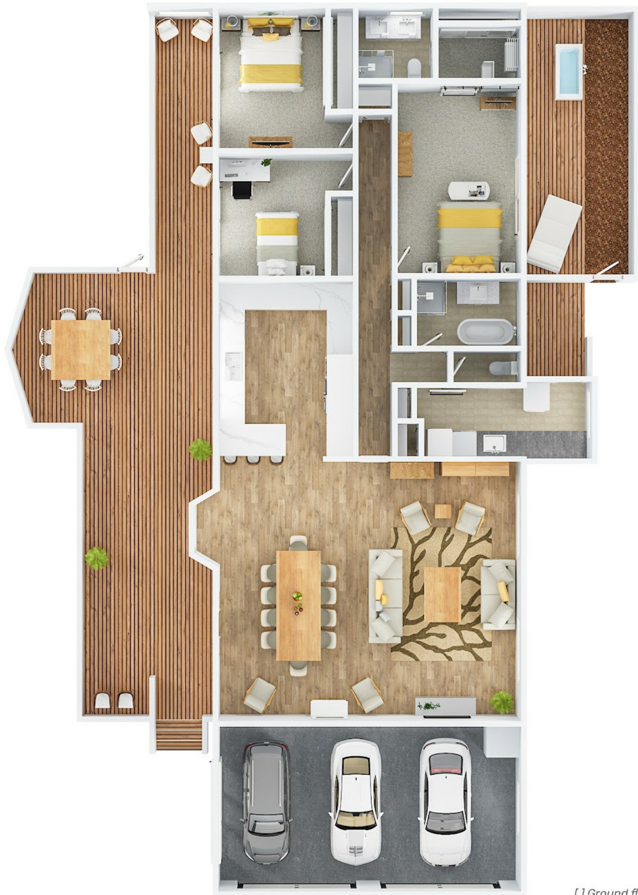
[ ] Ground floor

Disclaimer: Please note this floor plan is for marketing purposes and is to be used as a guide only. All dimensions are estimates only and may not be exact measurements.