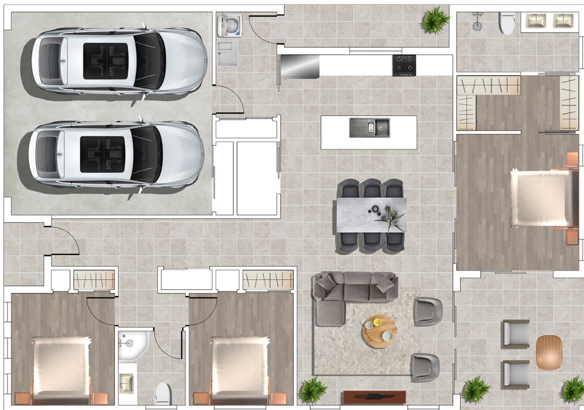
Tranquil 2 Floorplan