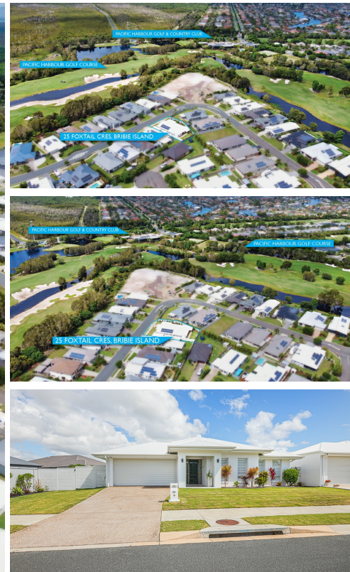
Keyline is for visual purposes only.