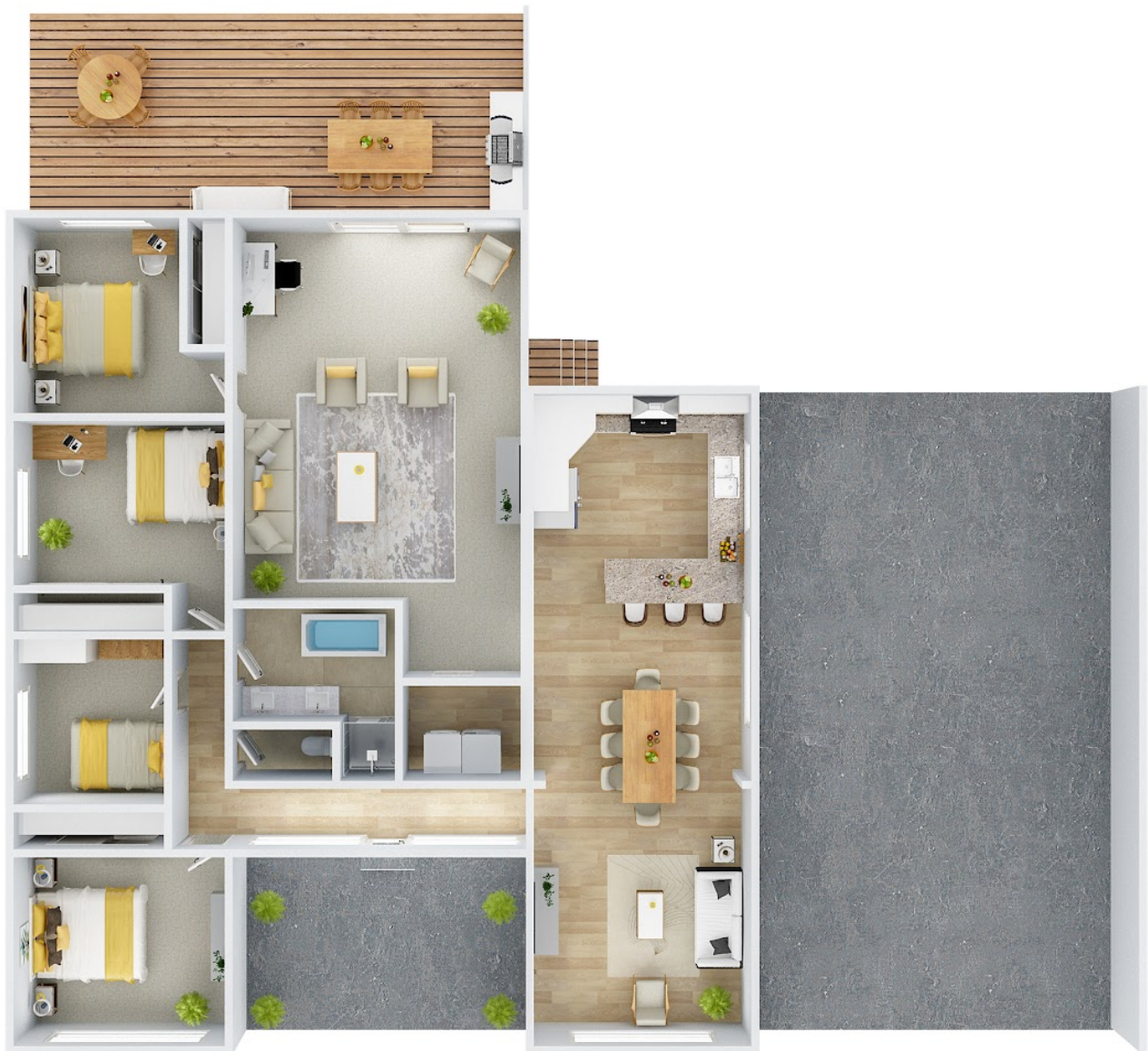
[ ]Ground floor