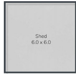
Not In Position