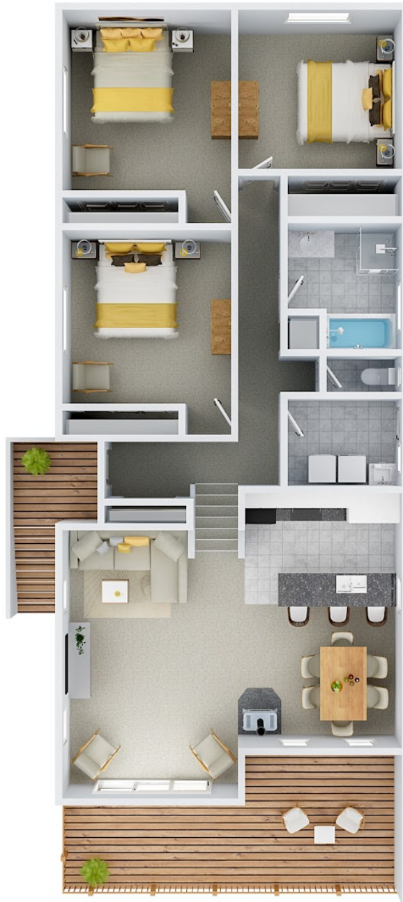
[ ] Ground floor