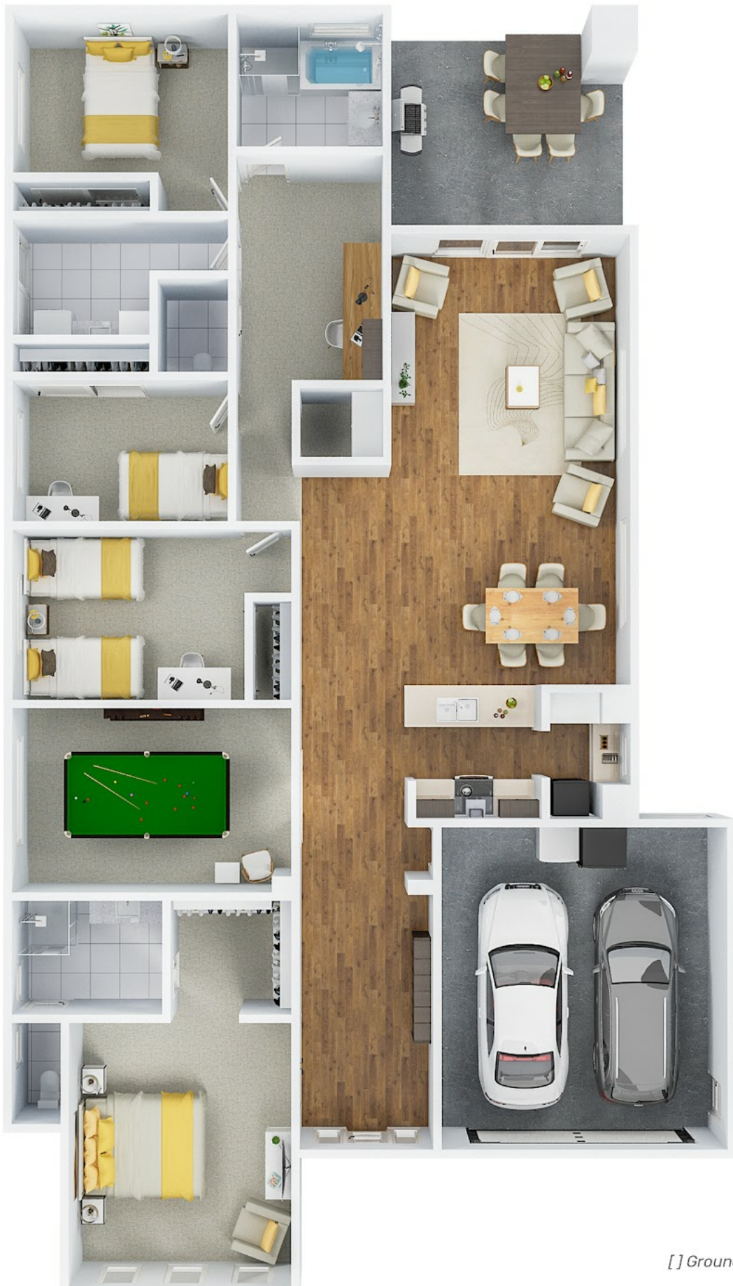
[ ] Ground floor

Disclaimer: Please note this floor plan is for marketing purposes and is to be used as a guide only. All dimensions are estimates only and may not be exact measurements.