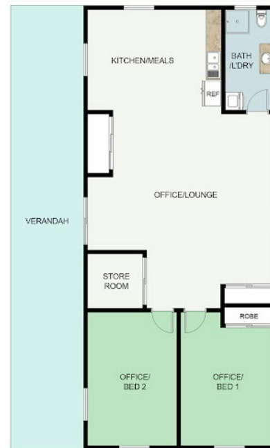
OFFICE/GRANNY FLAT FLOOR PLAN