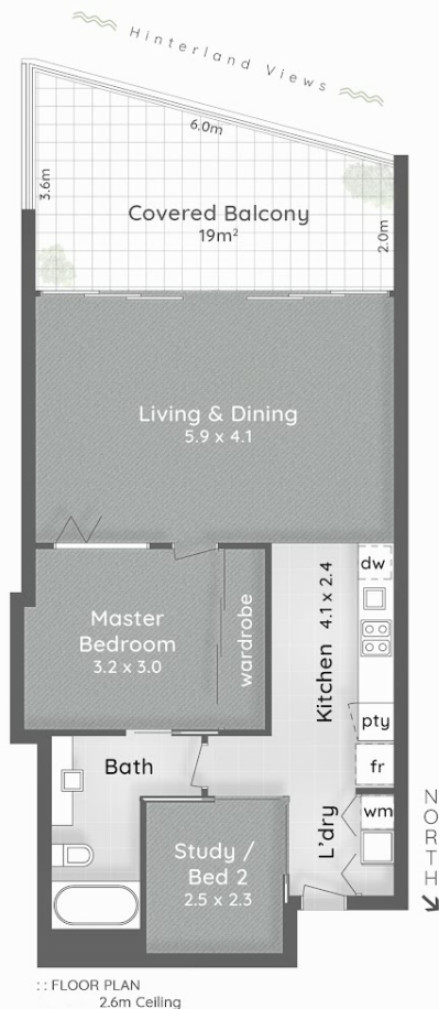
:: FLOOR PLAN 2.6m Ceiling