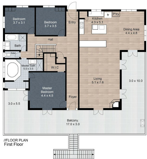
//FLOOR PLAN First Floor

Whilst every attempt has been made to ensure the accuracy of the floor plan contained here, measurements of doors, windows, rooms and any other items are approximate and no responsibility is taken for error, omission or mis-statement. This plan is for illustrative purposes only and should only be used as such by any prospective purchaser. The services systems and appliances shown have not been tested and no guarantee as to their operability or efficiency can be given. Created by GoldCoast Photography (c) 2022. www.goldcoast.photography 0402 042 799.