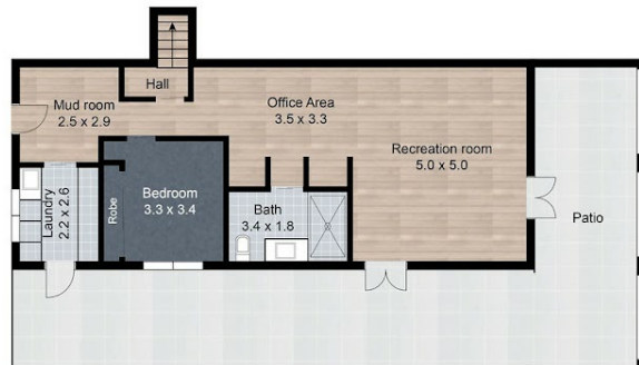
//FLOOR PLAN Ground Floor