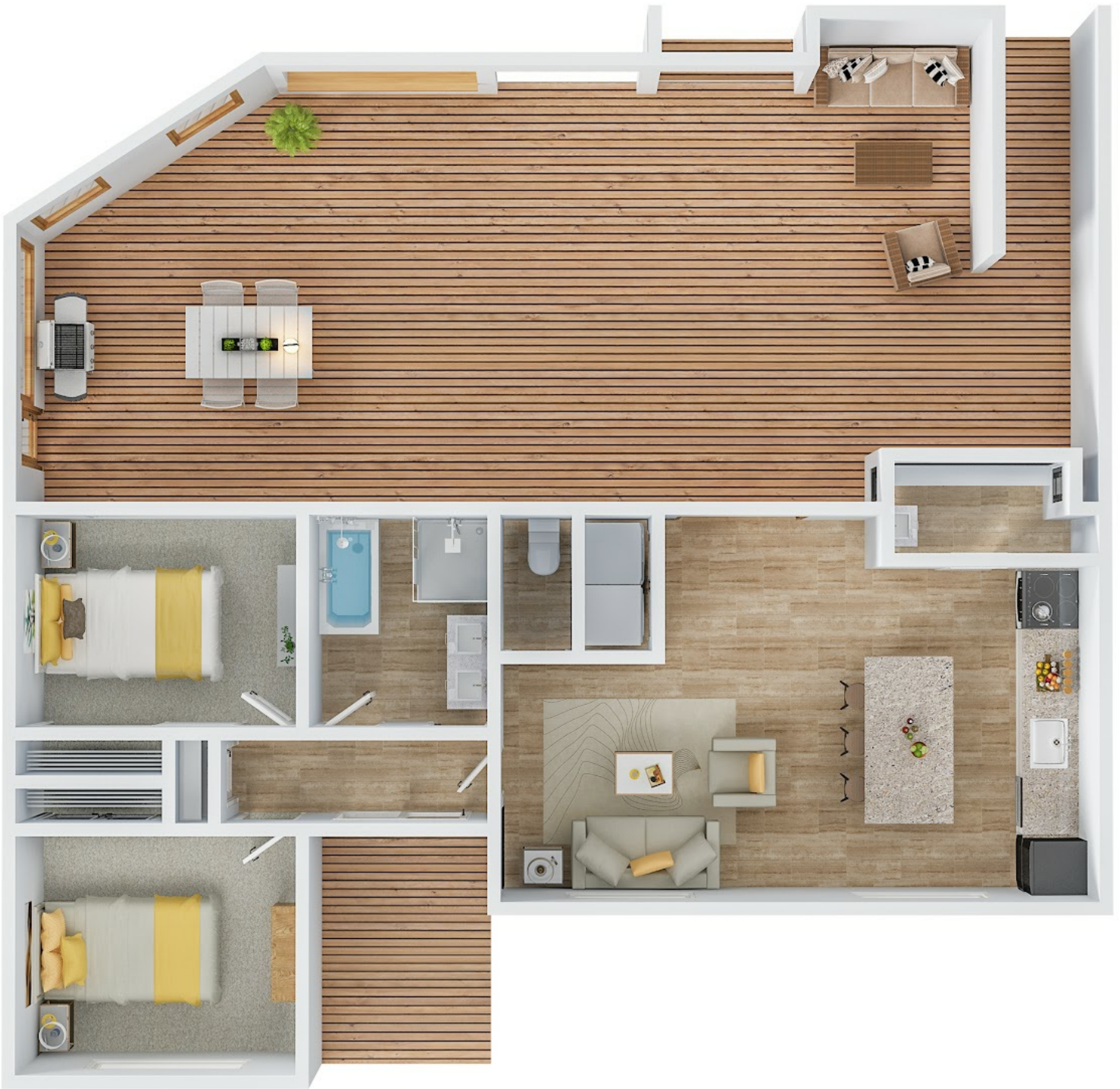
[ ] Ground floor

Disclaimer: Please note this floor plan is for marketing purposes and is to be used as a guide only. All dimensions are estimates only and may not be exact measurements.