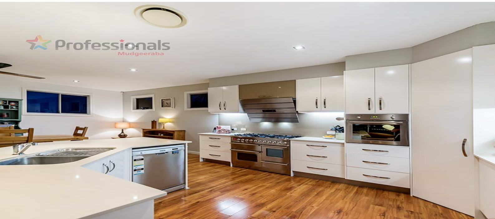
46 Cordyline Drive, ReedyCreek Land 718m 2 | Garage 2 cars | Bedroom 4 | Bathrooms 2 | Living 2 Total approximates. Floor Area 350sqm +