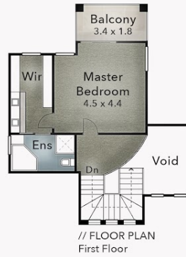
// FLOOR PLAN First Floor