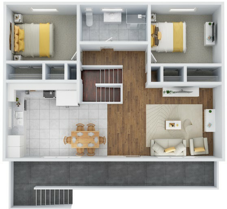
[ ] First floor

Disclaimer: Please note this floor plan is for marketing purposes and is to be used as a guide only. All dimensions are estimates only and may not be exact measurements.