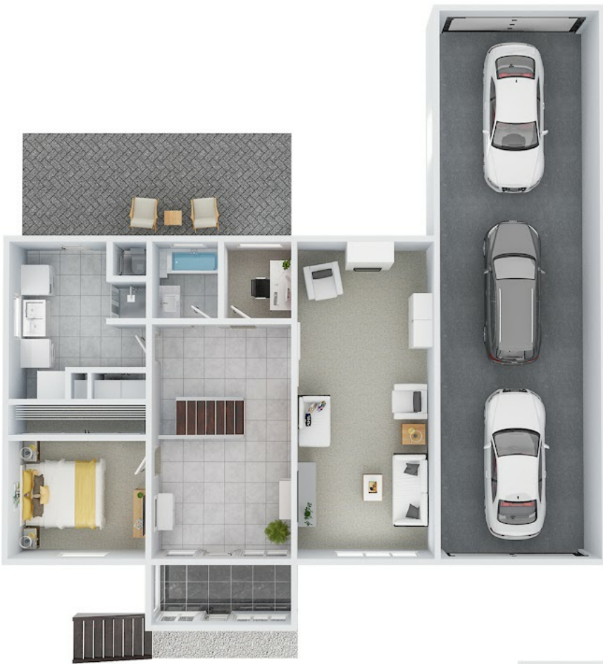
[ ] Ground floor