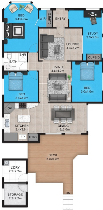
HOUSE 172.4 SQM