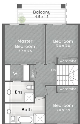
:: FIRST FLOOR