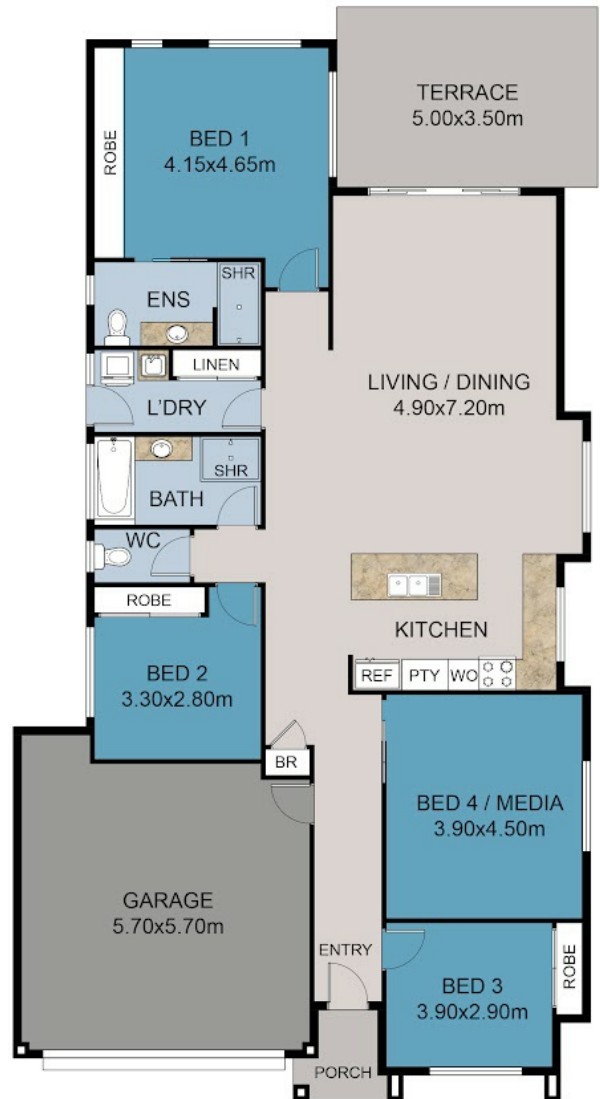
F L O O R P L A N

Disclaimer: Please note this floor plan is for marketing purposes and is to be used as a guide only. All dimensions are estimates only and may not be exact measurements.