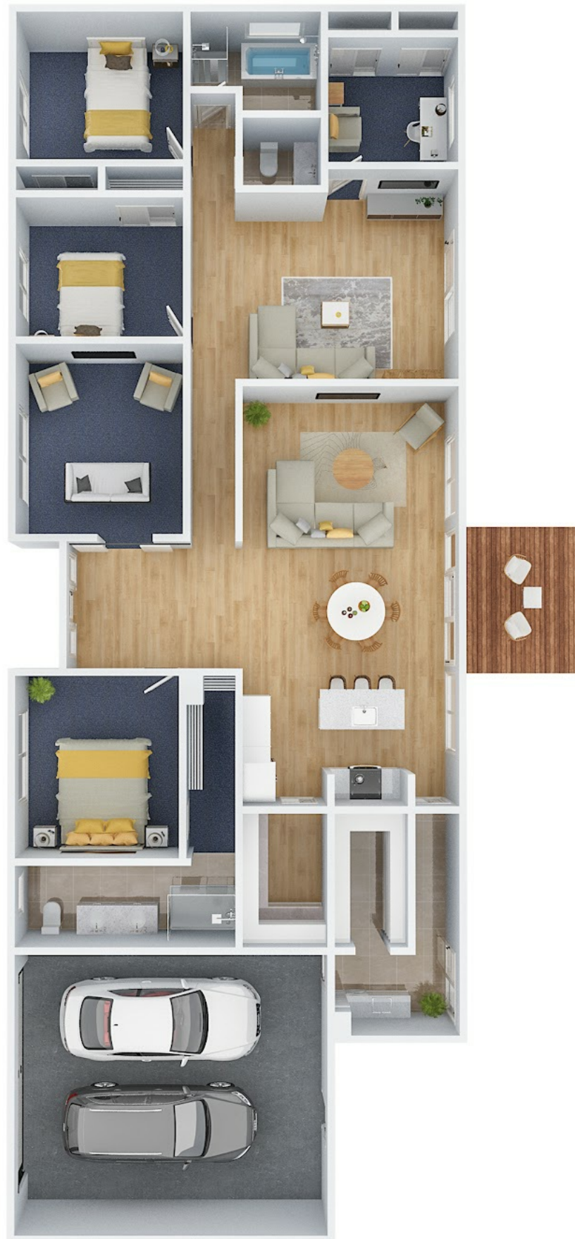
[ ] Ground floor

Disclaimer: Please note this floor plan is for marketing purposes and is to be used as a guide only. All dimensions are estimates only and may not be exact measurements.