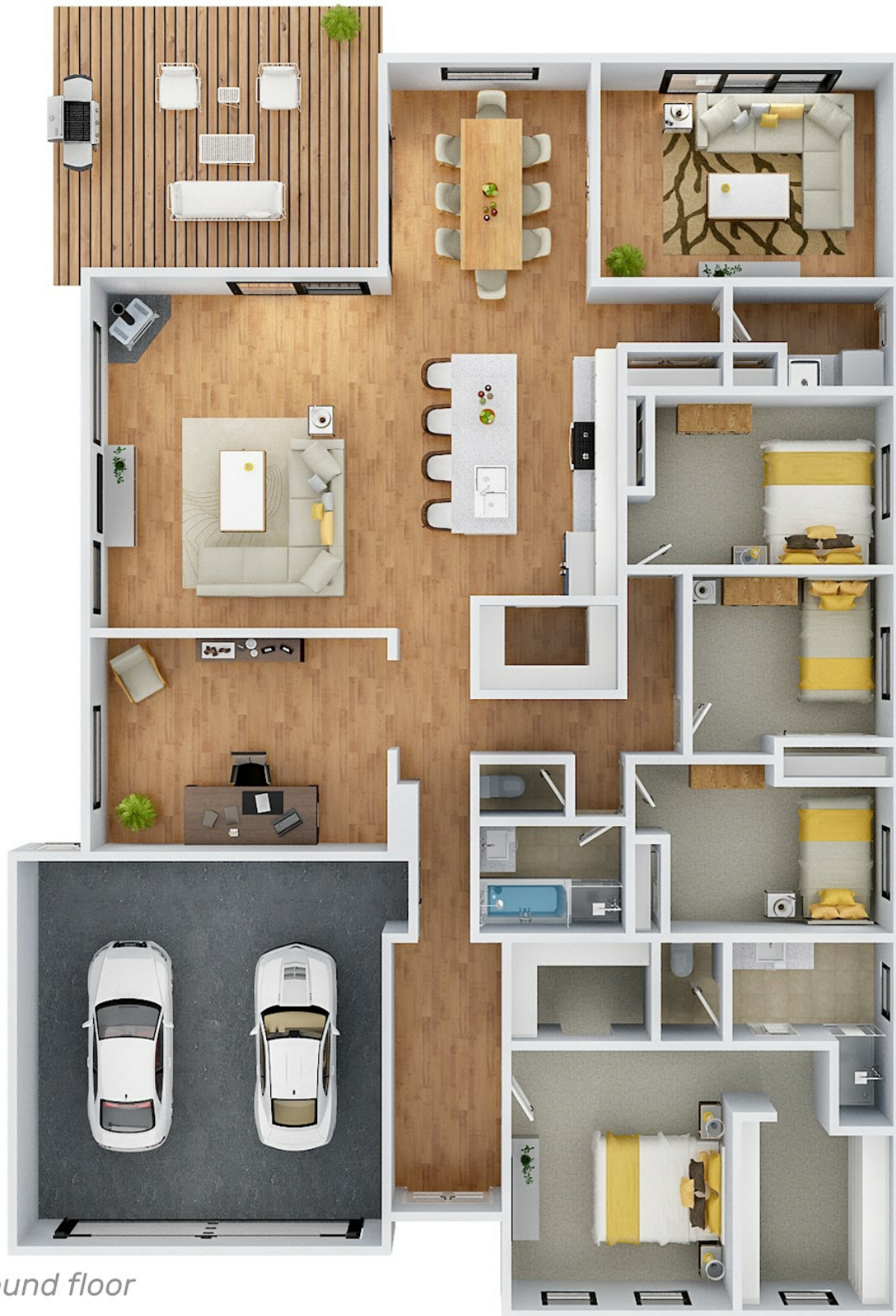
[ ]Ground floor