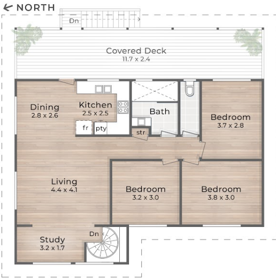
:: FLOOR PLAN First Floor