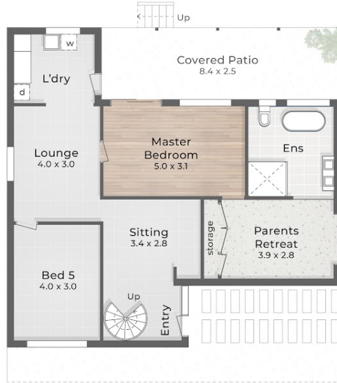
:: FLOOR PLAN Ground Floor