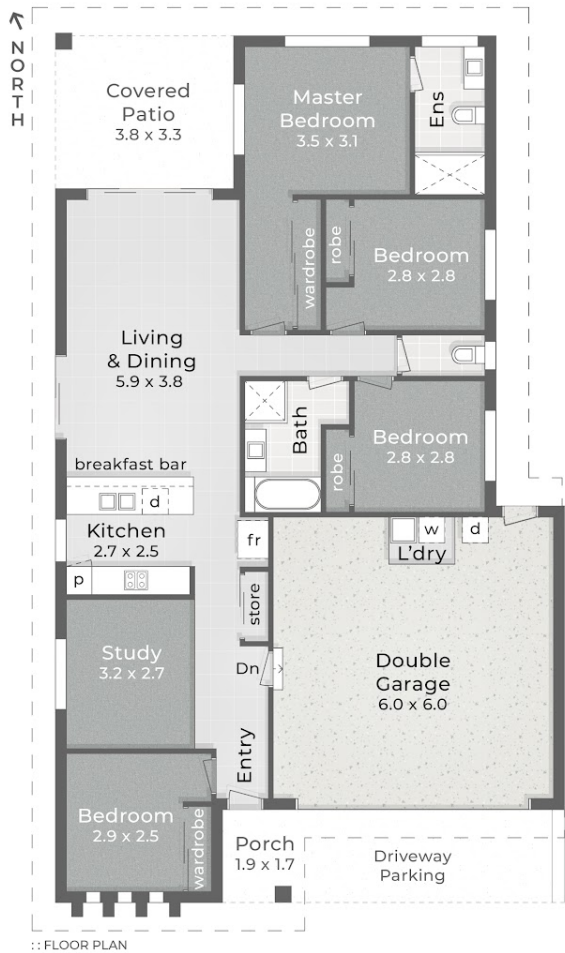
:: FLOOR PLAN