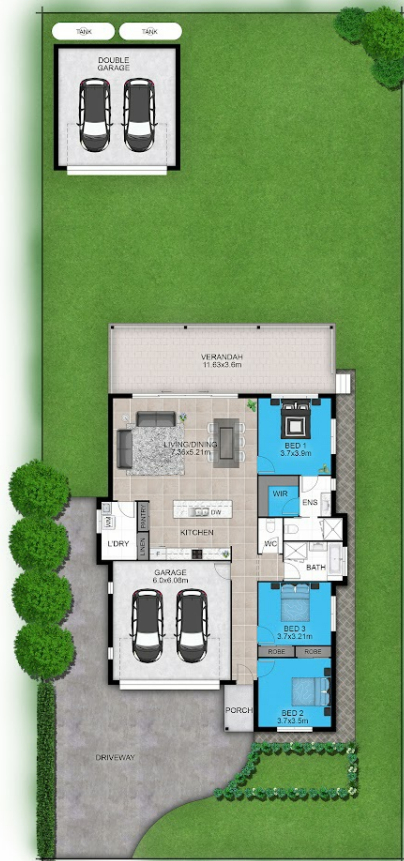
FLOOR PLAN ON SITE PLAN

This floor plan including furniture, fixture measurements and dimensions are approximate and for illustrative purposes only. BoxBrownie.com gives no guarantee, warranty or representation as to the accuracy and layout. All enquiries must be directed to the agent, vendor or party representing this floor plan.