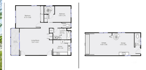
1/21 Childs Street Clayfield THIS FLOOR PLAN IS PROVIDED WITHOUT WARRANTY OF ANY KIND. BUYERS SHOULD CONDUCT THEIR OWN VERIFICATION OF ALL DETAILS. CONTACT THE REALTOR FOR MORE INFORMATION. Floor: 2 Bedrooms: 2 Floor Living Internal Area: 110.00 sqm Balcony/Patio: 6.00 sqm