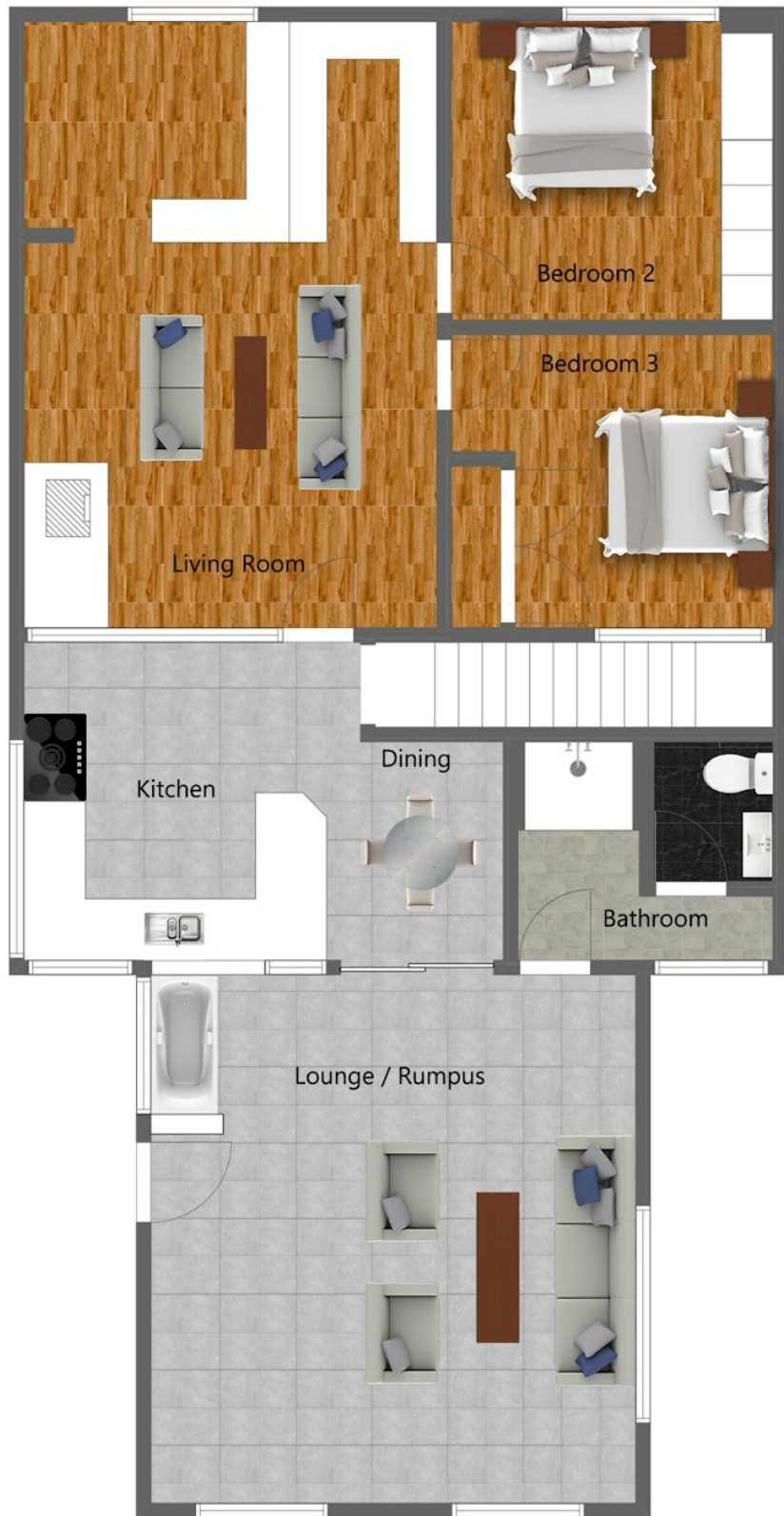
[ ] First floor