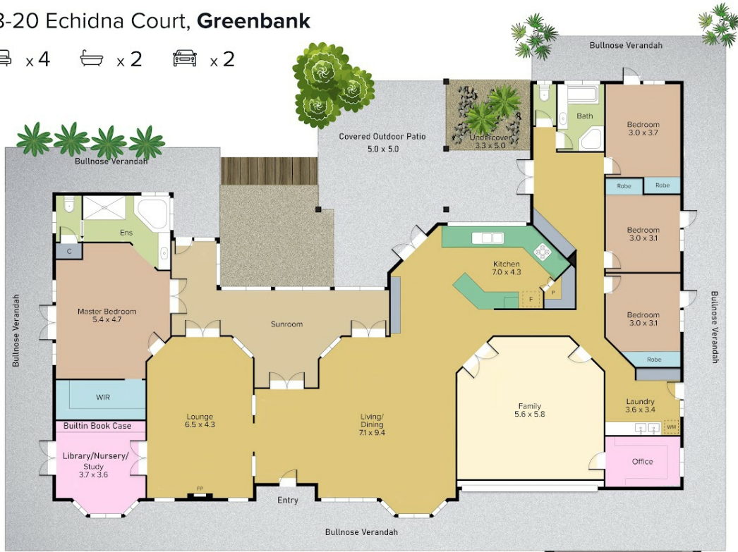
Floor Plan Ground Floor