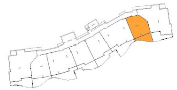
LEVELS 2 - 5