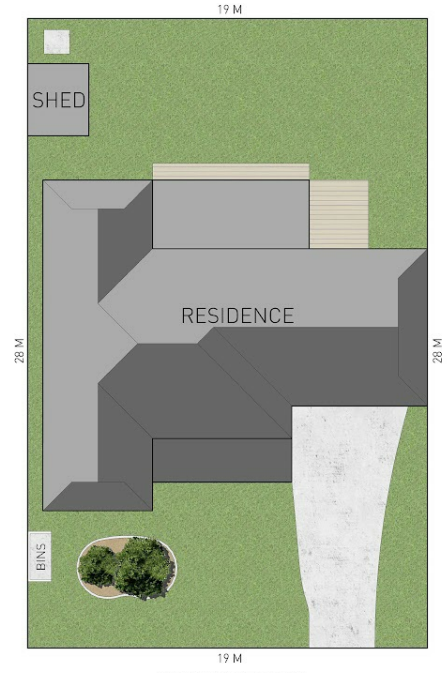
BAILEY STREET SITE PLAN