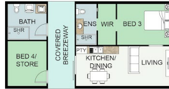
FLOOR PLAN-TEENAGERS RETREAT

This floor plan including furniture, fixture measurements and dimensions are approximate and for illustrative purposes only. BoxBrownie.com gives no guarantee, warranty or representation as to the accuracy and layout. All enquiries must be directed to the agent, vendor or party representing this floor plan.