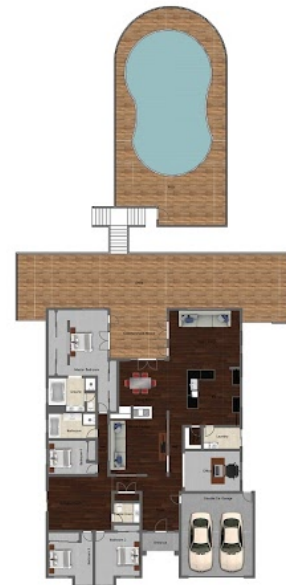
[ ] Ground floor

Disclaimer: Please note this floor plan is for marketing purposes and is to be used as a guide only. All dimensions are estimates only and may not be exact measurements.