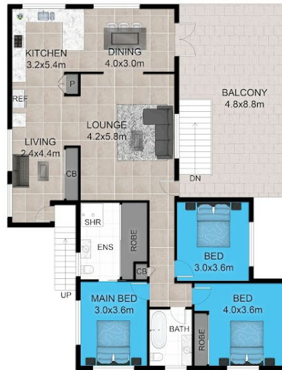
FIRST FLOOR Floor Area: 192 Sqm