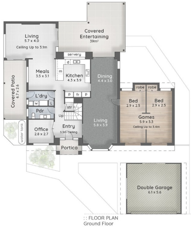
:: FLOOR PLAN Ground Floor