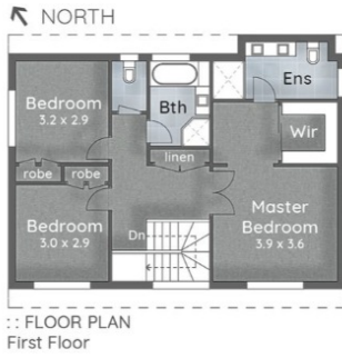
:: FLOOR PLAN First Floor