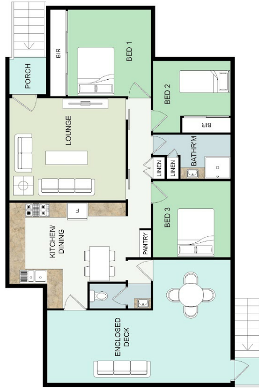
UPSTAIRS FLOOR PLAN

This floor plan including furniture, fixture measurements and dimensions are approximate and for illustrative purposes only. BoxBrownie.com gives no guarantee, warranty or representation as to the accuracy and layout. All enquiries must be directed to the agent, vendor or party representing this floor plan.