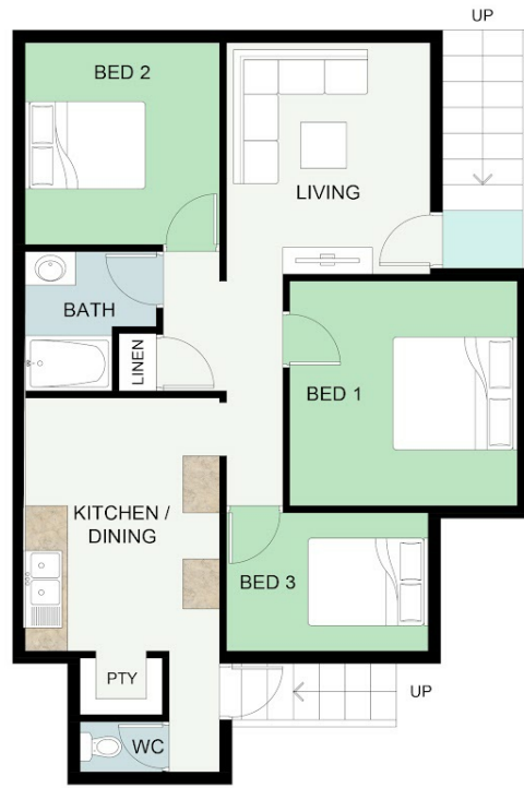
U P S T A I R S

This floor plan including furniture, fixture measurements and dimensions are approximate and for illustrative purposes only. BoxBrownie.com gives no guarantee, warranty or representation as to the accuracy and layout. All enquiries must be directed to the agent, vendor or party representing this floor plan.