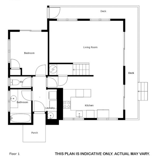
Disclaimer: Please note this floor plan is for marketing purposes and is to be used as a guide only. All dimensions are estimates only and may not be exact measurements.