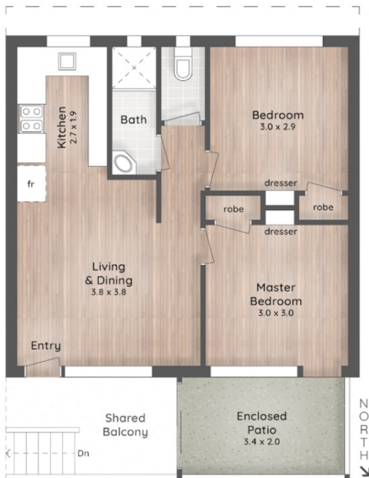
:: FLOOR PLAN Level 1 - 2.6m Ceiling