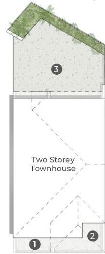
DRIVEWAY ACCESS TO JEFFERSON COURT