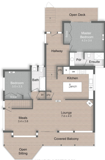
MID LEVEL & FIRST FLOOR