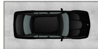
SEPARATE CAR PORT

Whilst every attempt has been made to ensure the accuracy of the floor plan. Measurements of doors, windows rooms and any other items are approximate and no responsibility is taken for any error, omission or misstatement. This plan is for illustrative purposes only and should be used as such by any prospective purchaser.