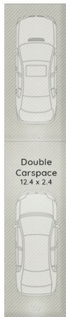
:: FLOOR PLAN Basement