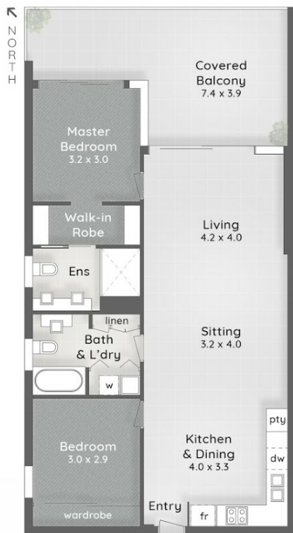
:: FLOOR PLAN 2.7m Ceiling